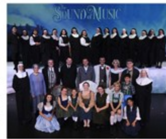
BEST ENSEMBLE *and* BEST MUSICAL The Sound of Music South Bay Musical Theatre